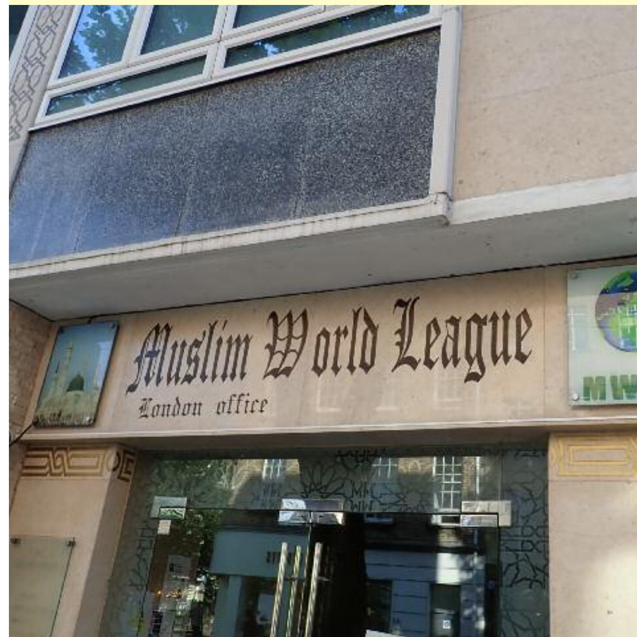
Goodge Street Mosque entrance